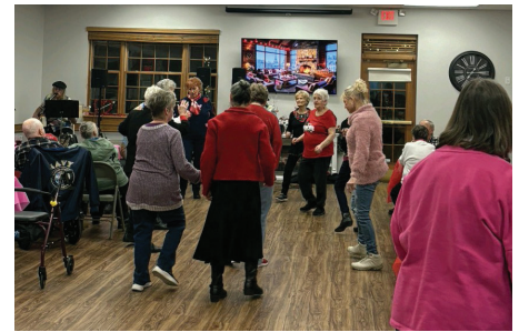
Valentine's Dinner & Dance

June 30: 11 am, Lunch & Movie Bus Trip, TBD